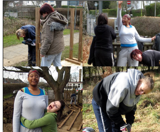
Townsend House residents have fun gardening

Five Townsend House residents joined ten other volunteers who took part in an environmental skills training project, run by Groundworks Hertfordshire, to create an outdoor classroom for students at Cowley Hill Primary School in Borehamwood. After six weeks of hard work, the project was completed in March.