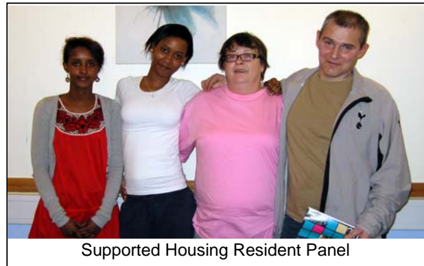
Supported Housing Resident Panel

The issues of our Supported Housing and our General Needs residents are quite different, so it is our intention to organise a separate General Needs panel. Letters are being sent out informing General Needs residents of the process to become a resident representative.