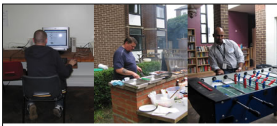
Conway House Open Day

The open day was a great success. The residents prepared a BBQ, music played in the garden and games were played both indoors and outside. Visitors were given guided tours of the Mutrix Project and there was a very positive mood.