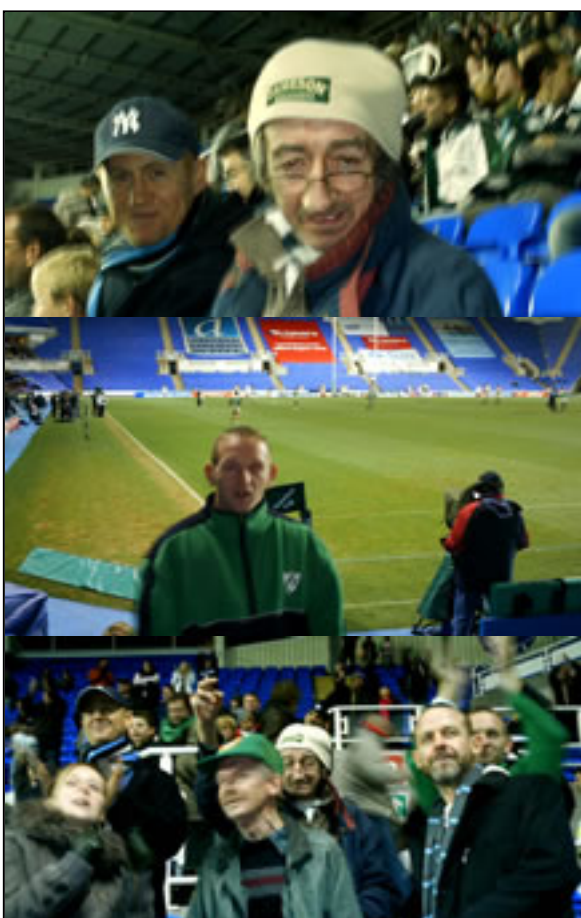
Day out at Madejski Stadium